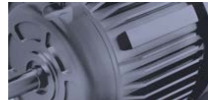
Low voltage motors