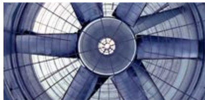
Variable speed drive systems