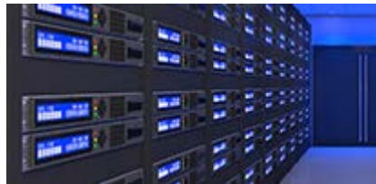
Uninterruptible power supplies