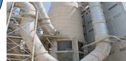
High voltage motors